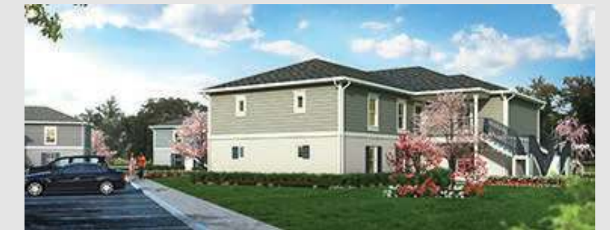
WAYNE DENSCH CENTER