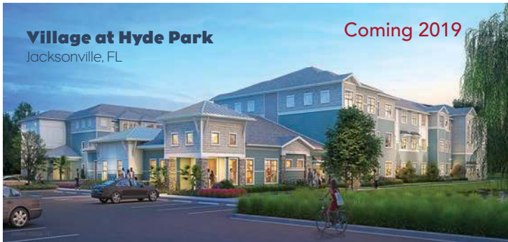
Village at Hyde Park Jacksonville, FL