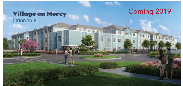
Village on Mercy Orlando, FL