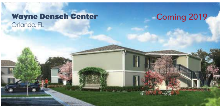
Wayne Densch Center Orlando, FL